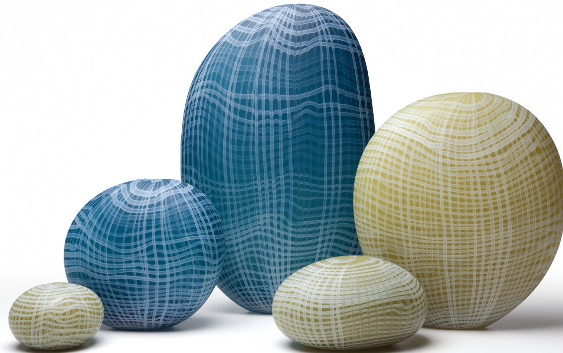
Clare Belfrage Born 1966, Australia Pistachio and Blue Collection , 2015 hand-sanded and polished blown glass with cane drawing (set of 5 pieces) H 35 × W 52 × D 30 cm

ACU Art Collection artsandculture.acu.edu.au