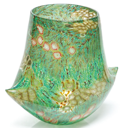
Jennifer Kemarre Martiniello Born 1949, Australia Arrernte language group Bush Flowers Bicornual #22 , 2018 hot blown glass with murrine H 26 × W 30 × D 15 cm